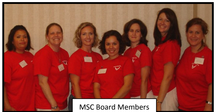
MSC Board Members

We want to hear from you! If you have ideas for events you'd like to see or suggestions for how we can improve, please let us know! Contact information for all MSC Board Members can be found at www.moodyspousesclub.com .